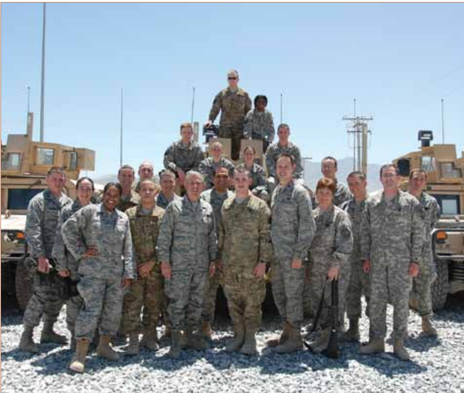
Members of the Navy Judge Advocate General's Corps gathered for a picture with their fellow service members from Combined Joint Interagency Task Force-435. Task Force-435, in partnership with the Government of the Islamic Republic of Afghanistan and U.S. interagency and international partners, conducts detention, corrections, judicial sector and biometrics operations.